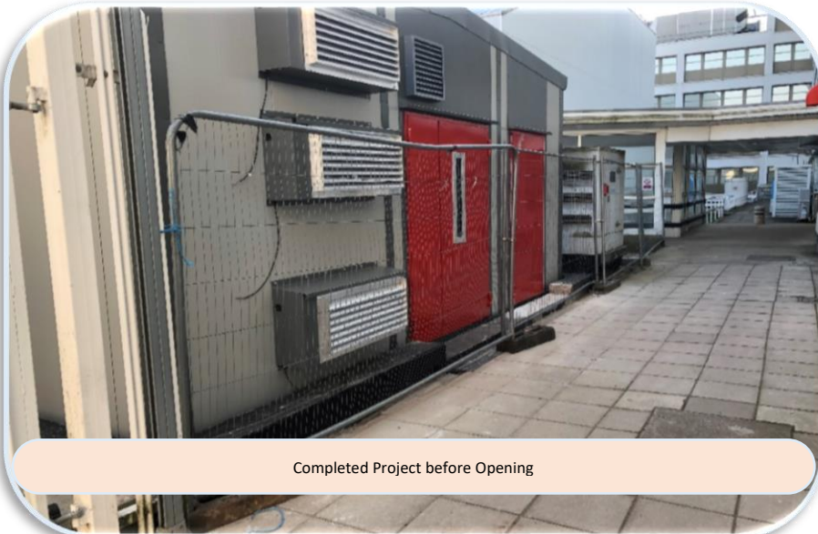
Completed Project before Opening