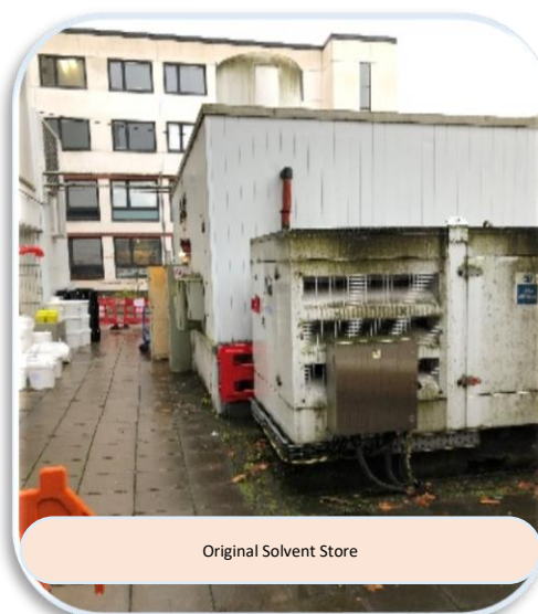
Original Solvent Store