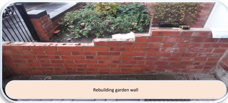
Rebuilding garden wall