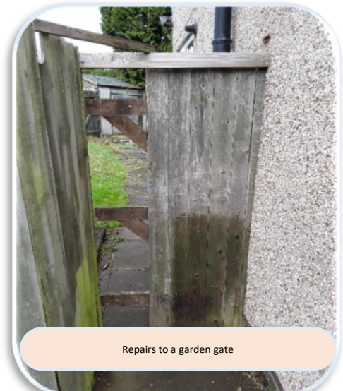
Repairs to a garden gate