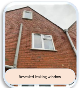
Resealed leaking window