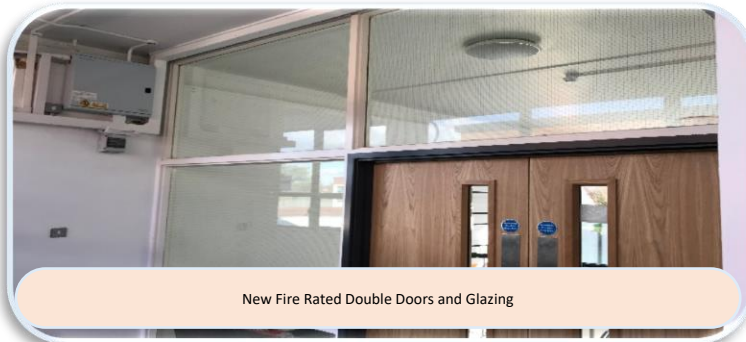
New Fire Rated Double Doors and Glazing