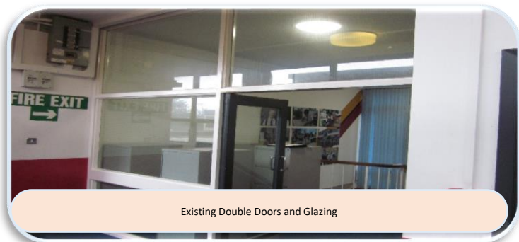
Existing Double Doors and Glazing