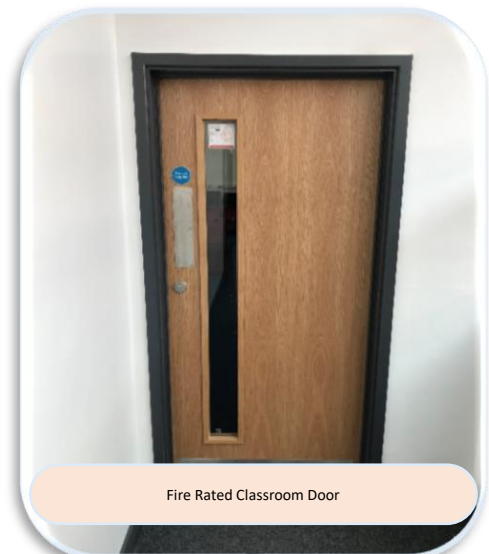
Fire Rated Classroom Door

Tel: (024) 76 466 877 Fax: 08721 130782 e-mail: admin@chielcon.co.uk web: www.chielcon.co.uk