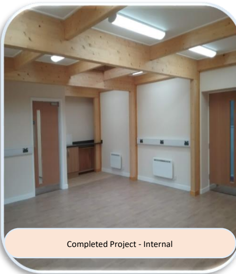
Completed Project - Internal