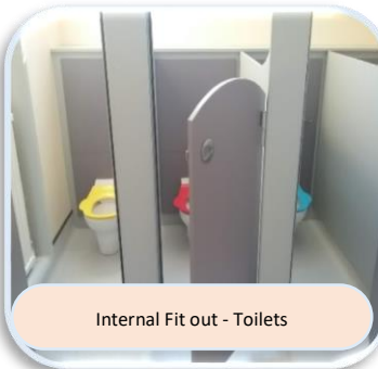
Internal Fit out - Toilets