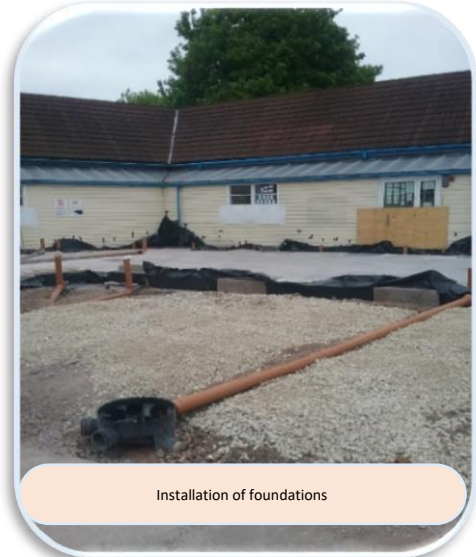
Installation of foundations

Tel: (024) 76 466 877 Fax: 08721 130782 e-mail: admin@chielcon.co.uk web: www.chielcon.co.uk