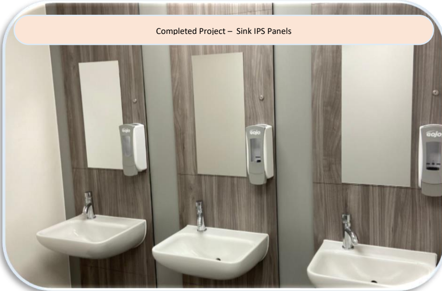
Completed Project – Sink IPS Panels