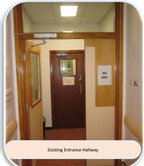
Existing Entrance Hallway