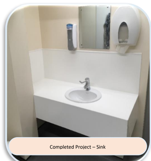
Completed Project – Sink

Tel: (024) 76 466 877 Fax: 08721 130782 e-mail: admin@chielcon.co.uk web: www.chielcon.co.uk