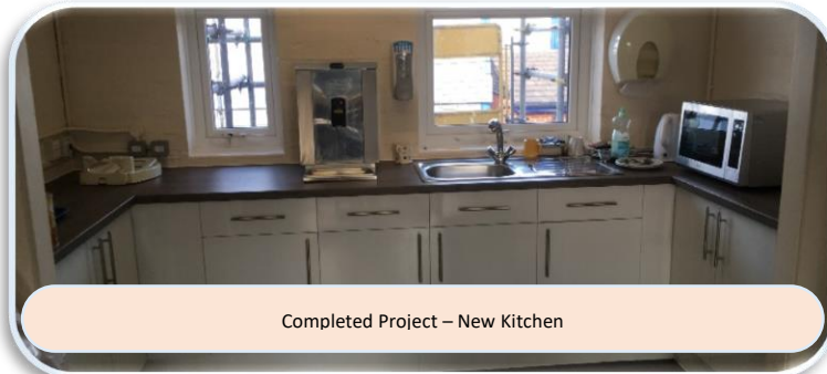
Completed Project – New Kitchen