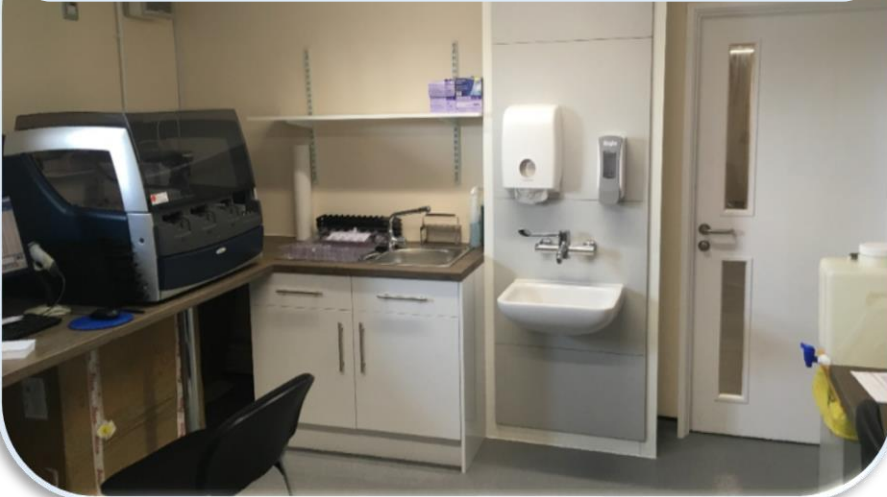
Completed Project – Flooring, IPS Systems & Worktops